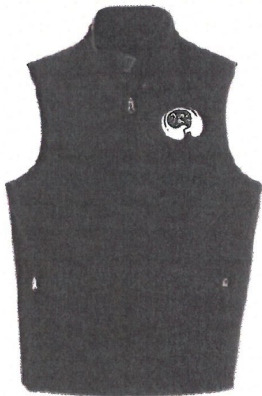
J325 & L325 MENS & LADIES PORT AUTHORITY CORE SOFT SHELL VEST