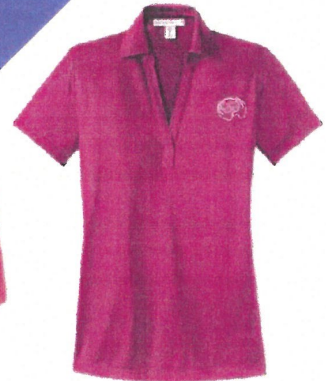
ST660 & LST660 MENS & LADIES SPORT-TEK HEATHER CONTENDER POLO