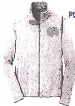
F232 & L232 MENS & LADIES PORT AUTHORITY SWEATER FLEECE JACKET