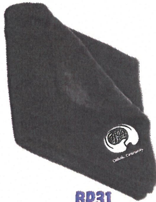
BP31 PORT AUTHORITY ULTRA PLUSH BLANKET