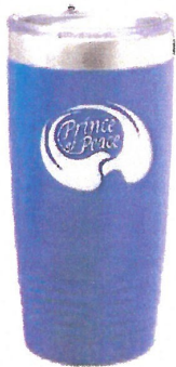
TUMBLER 20 OZ POLAR CAMEL