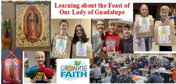
Learning about the Feast of Our Lady of Guadalupe

In partnership with parents, guardians, and the parish, we seek to help children deepen their relationship with Jesus, understand their Catholic faith, and participate in our Prince of Peace Catholic Community.